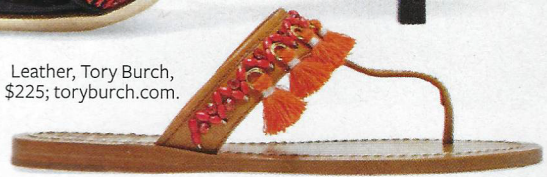
Leather, Tory Burch, $225; toryburch.com.