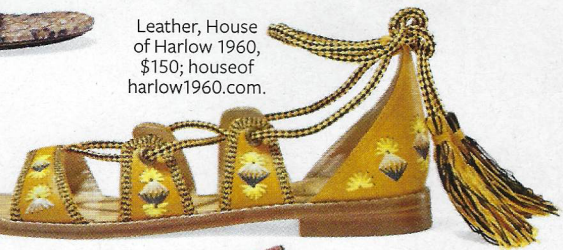
Leather, House of Harlow 1960, $150; houseofharlow1960.com.