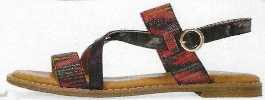
Cotton-polyester and faux leather, Sugar Shoes, $35; amazon.com.