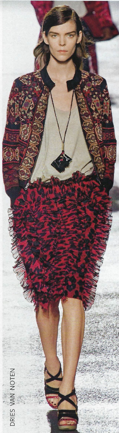
DRIES VAN NOTEN

It's your world! So slip on tasseled flats with jeans and a top, or do strappy sandals with mismatched pieces à la Dries Van Noten.