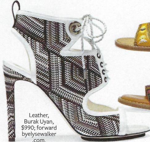
Leather, Burak Uyan, $990; forwardbyelysewalker.com.