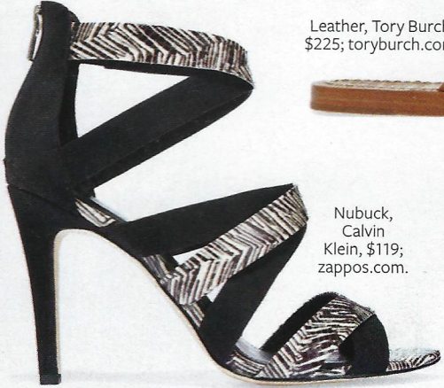
Nubuck, Calvin Klein, $119; zappos.com.