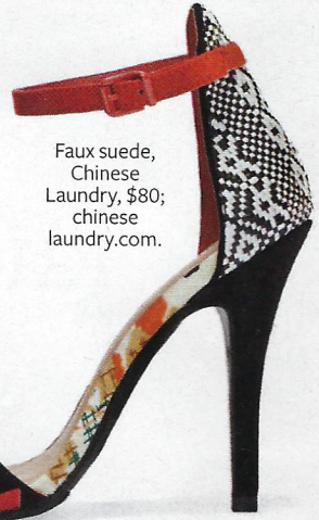
Faux suede, Chinese Laundry, $80; chinese laundry.com.