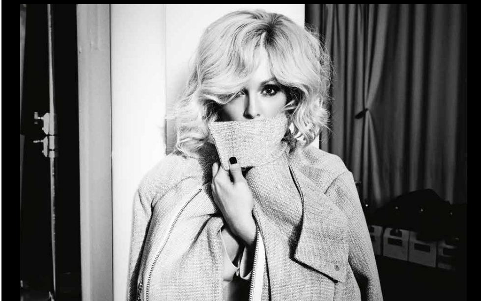
Mint green dress w. pearl fringes MIU MIU – Red leather stilettos BURAK UYAN Choker w. emerald beads & white diamonds SHAMBALLA JEWELS (Bottom image): "Lovecoat" sky-blue jacket DESIGNERS REMIX