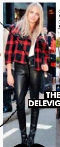
Cut Pro Ca Bu stre