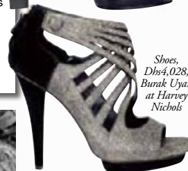
Shoes, Dh4,028, Burak Uyan at Harvey Nichols